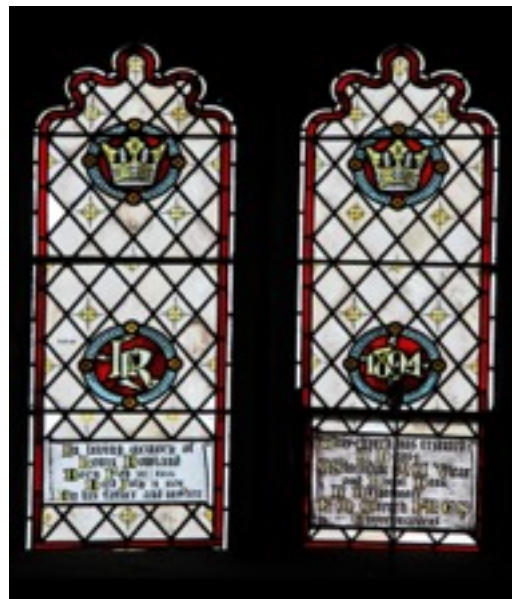
Clerestory Window A

It is likely that these windows were included in the restoration, and that this was the first to set the tone for the rest. The dates in the windows are consistent with this suggestion